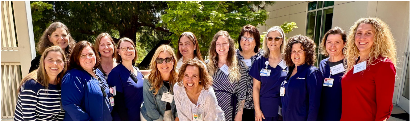
Guardian Angels gather at our reception in their honor, bringing together both donors and their care providers.